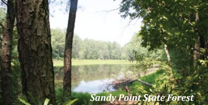
Sandy Point State Forest

A State Forest Use Permit is required for hunting, trapping, fishing, bike riding and horse riding on Virginia State Forests. Permits are required for individuals age 16 and older, and can be purchased online for $15.00 at http://secure01.virginiainteractive.org/horf/ or where hunting licenses are sold.