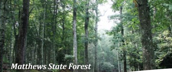
Matthews State Forest