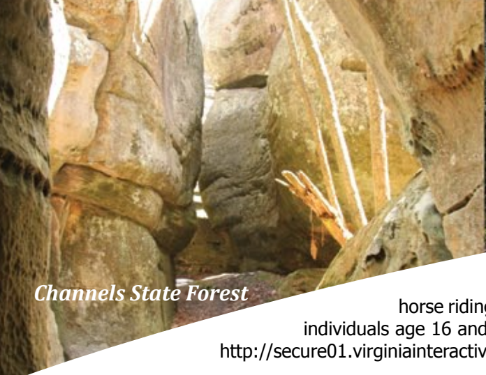
Channels State Forest