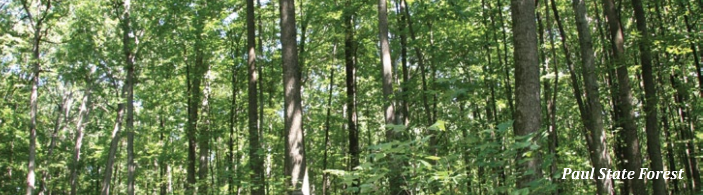
Paul State Forest